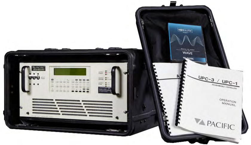
Transit case with front cover removed & operation manuals