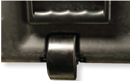
Integrated nylon ball-bearing wheels