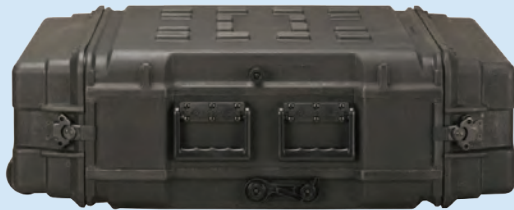
3U Transit case with front and back covers Installed