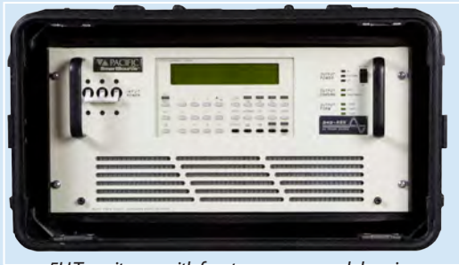
5U Transit case with front cover removed showing 345ASX-UPC3 front panel

Within the case is an aluminum rack, suspended on heavy-duty shock mounts, to help protect the power source during transport and storage. Slide rails are provided to facilitate mounting or removal of the power source within the transit case. A pressure relief valve and tie downs are also provided.