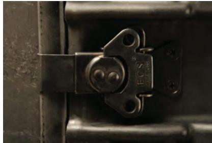
Stainless steel latches