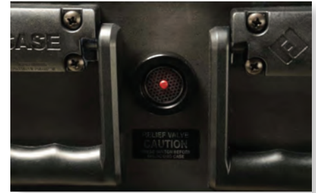
Sturdy comfortable handles & pressure relief valve